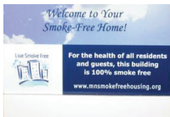
Magnetic Notepad 3.5" X 6"

* 'Electronic cigarettes' must specifically be mentioned in your policy to receive electronic cigarette signs.