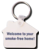
Rubber Key Chain