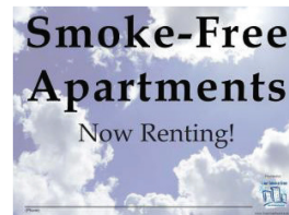
Lawn Sign 18" X 24" plastic, two-sided