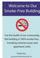
Window Cling 4.5" X 6.5"